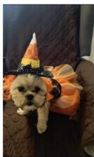
Best Dressed Daisy