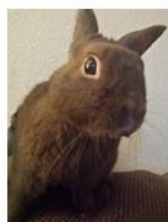
Cutest Overall Bobbin