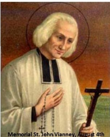
Memorial St. John Vianney, August 4th

"Private prayer is like straw scattered here and there: If you set it on fire, it makes a lot of little flames. But gather these straws into a bundle and light them, and you get a mighty fire, rising like a column into the sky; public prayer is like that." — St. John Vianney