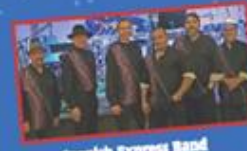
Spanish Express Band