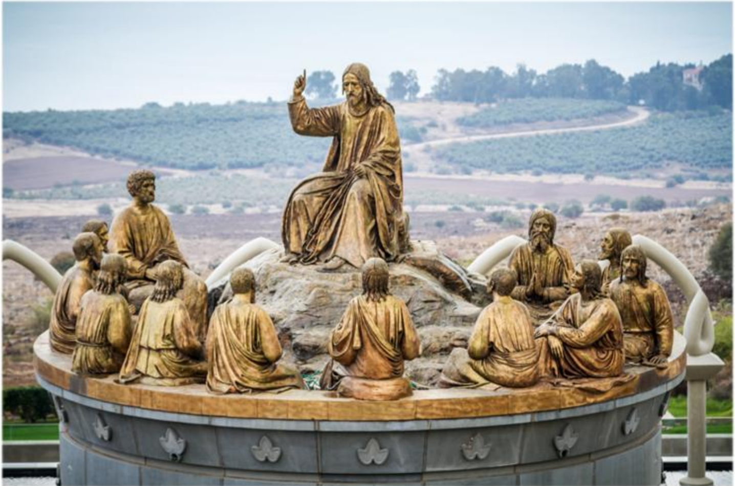
GALILEE, ISRAEL - DECEMBER 3: The statues of Jesus and Twelve Apostles in Domus Galilaeae on the Mount of Beatitudes near the Sea of Galilee in Galilee, Israel on December 3, 2016