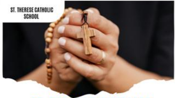
ST. THERESE CATHOLIC SCHOOL