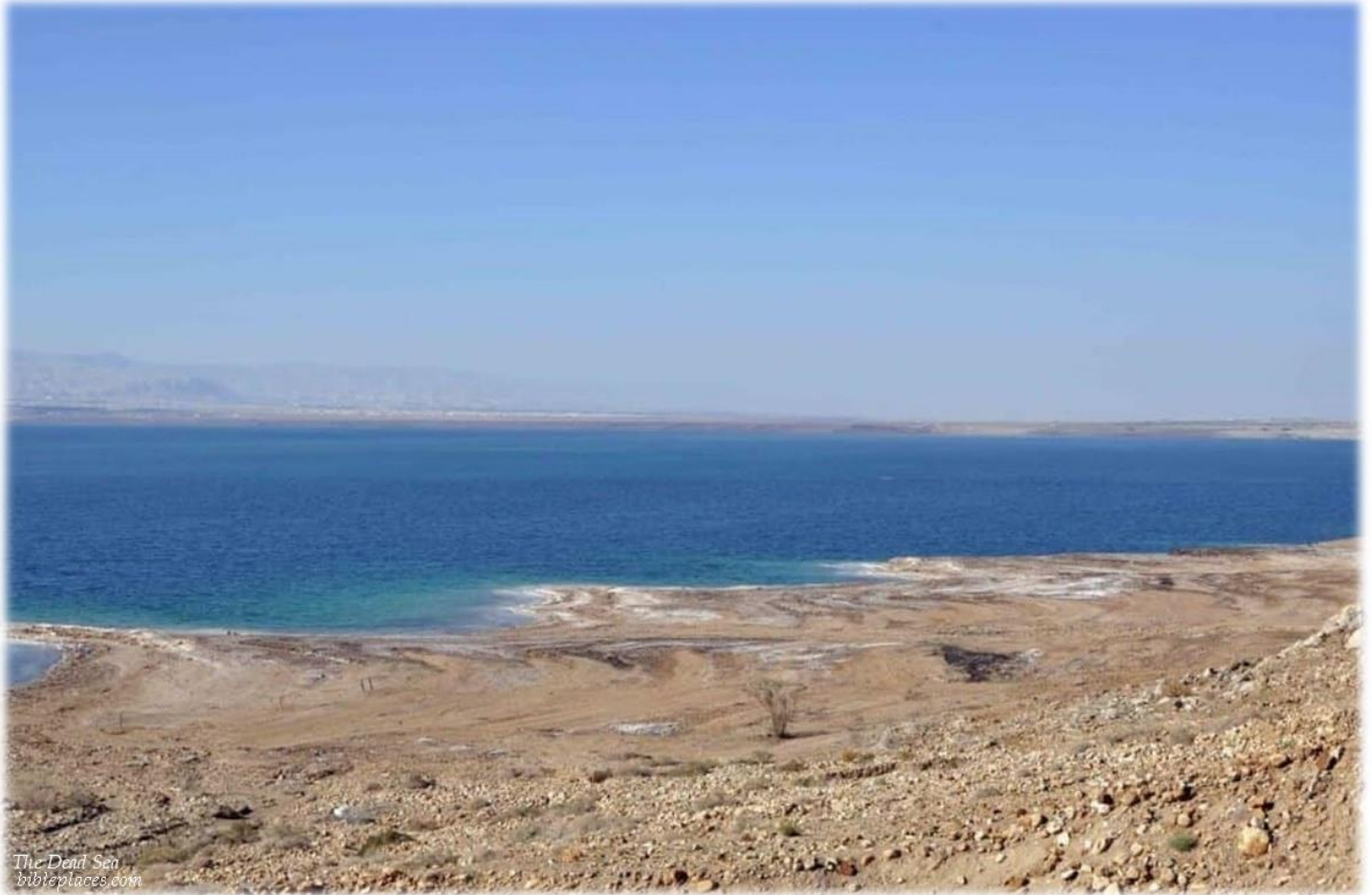
The Dead Sea

The apostles gathered together with Jesus and reported all they had done and taught.