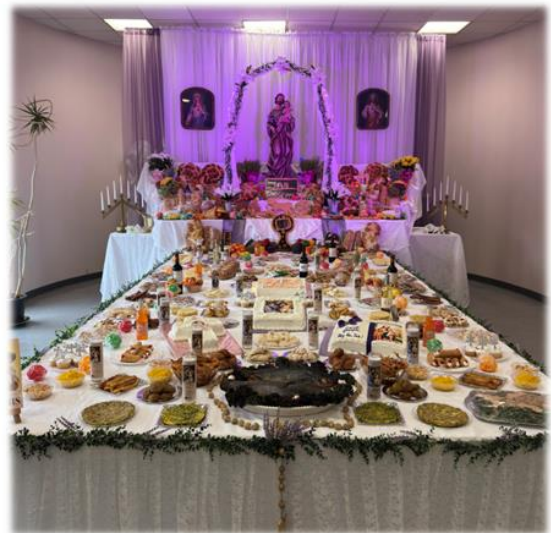
St. Joseph Table 2025

TOTUS TUUS 2025 Mark your calendars! The Shrine will be hosting Totus Tuus June 22nd – June 27th Lookout for more details in future bulletins.