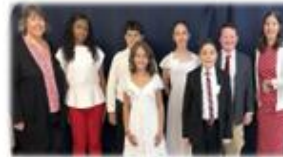
Confirmation May 7, 2026