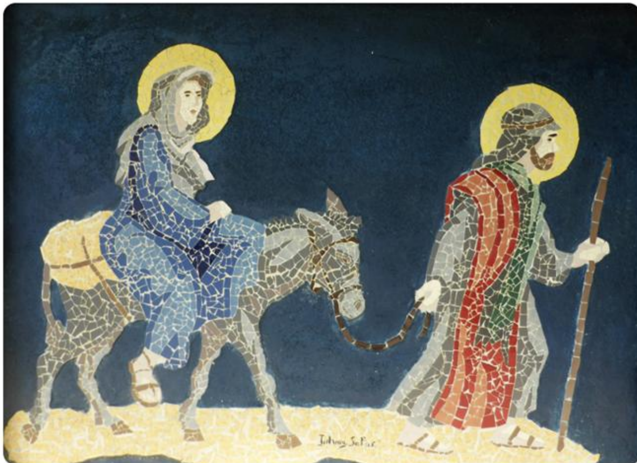
Exterior wall of a house with a mosaic of Johany Sofer on the street in Bethlehem in Palestine